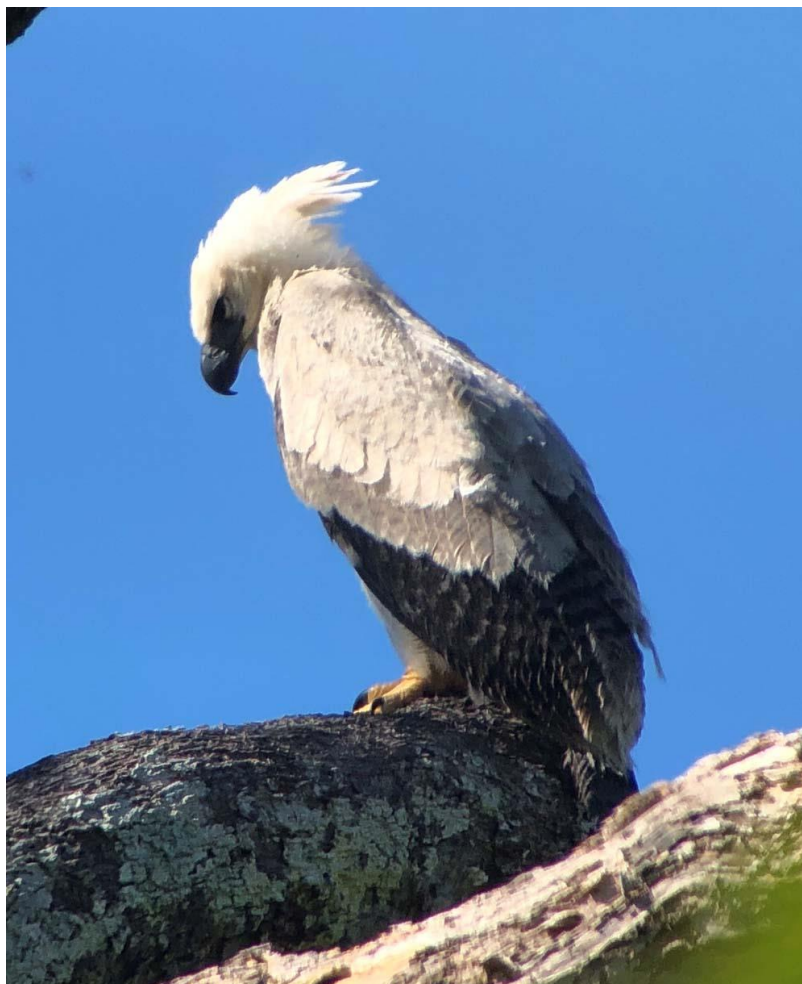
Harpy Eagle, juvenile; SouthWild Amazon