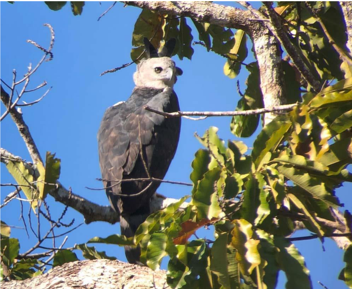
Harpy Eagle, SouthWild Amazon

For many, seeing a Harpy Eagle is the top avian prize of a trip to the Neotropics. Regal in its bearing and a symbol of unspoiled nature, the Harpy ranks with the Jaguar as South America's ultimate predators.