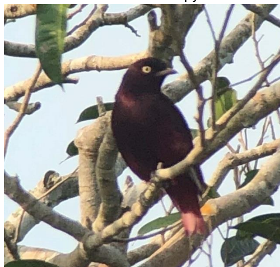
Pompadour Cotinga, male © Brooke Smith

The Canopy Tower: Within twenty minutes of the lodge is a 24-meter (79-foot) high canopy tower. Solidly constructed and engineered to precision, the tower offers rare access to the forest canopy and a different world than what we experience at ground level. Standing atop a spacious platform, we'll scan the surrounding boughs and treetops for birds and animals otherwise invisible from the forest floor. We'll likely visit the canopy tower at least twice and our visits could yield special birds such as Spix's Guan, Red-throated Piping-Guan, Gray-headed Kite, Pompadour Cotinga, Black-fronted Nunbird, White-throated Toucan, White-necked Puffbird, Chestnut-eared Aracari, Red-stained Woodpecker, Dusky-capped Woodcreeper, Red-throated Caracara, Black-girdled Barbet, Paradise Jacamar, Paradise and Opal-rumped tanagers, and more. The canopy tower also presents outstanding opportunities to see Scarlet and Blue-and-yellow macaws passing by at eye level, an inspiring sight, for sure.