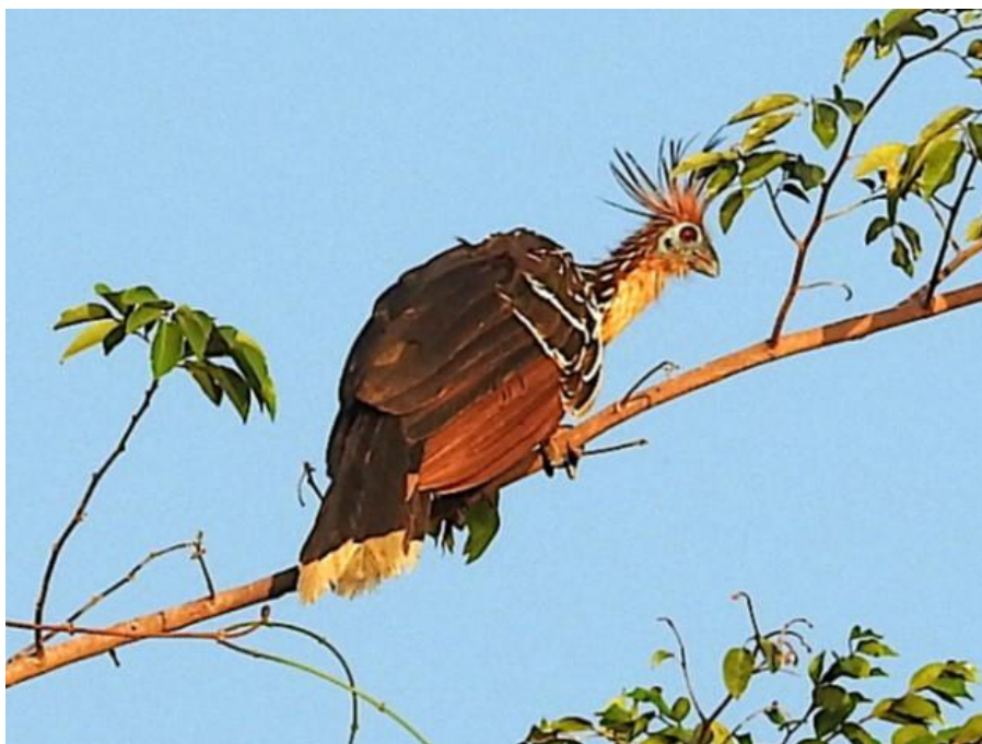
Hoatzin on the Rio Juruena

The Rio Juruena: One of the great pleasures of a stay at SouthWild Amazon Lodge is the opportunity to spend time on the Rio Juruena, an exceptionally beautiful tributary of the Amazon River, far to the north. Unlike many other rivers in the Amazon Basin, the Juruena—at least this part of it—is lightly impacted by the hand of man. Here, one does not see the riverside development, residential communities, or fleets of fishermen’s canoes on either bank for miles up and down the river. One of the few signs of human habitation is the station for the auto passenger ferry, which itself is an unobtrusive presence. Instead, the visitor is treated to a beautiful blackwater river, forested on both sides and peppered with islands, small rapids, and granite outcrops, all of which serve to braid the river into myriad channels. We