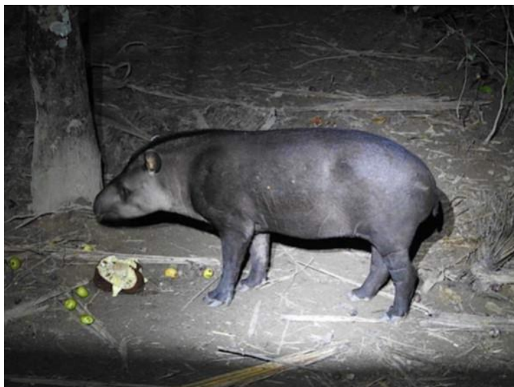
Brazilian Tapir, SouthWild Amazon

We will experience the river on several occasions through morning and afternoon boat rides. Our explorations will take us several miles both upstream and downstream as we search for birds and other wildlife. Of the many dozens of birds possible on any given boat trip, we’ll especially be on the watch for Sungrebe, Sunbittern, Razor-billed Curassow, Red-throated Piping-Guan, Slate-colored Hawk, Pied Lapwing, Greater Ani, Hoatzin, several species of kingfishers, Bare-necked Fruitcrow, Amazonian Umbrellabird, Varzea Schiffornis, Red-necked Aracari, Black-fronted Nunbird, Glossy Antshrike, Silvered Antbird, Amazonian Streaked-Antwren, Rusty-margined Flycatcher, Black-collared and White-banded swallows, Black-faced Dacnis, and Swallow Tanager. These boat trips—beautiful, peaceful, and evocative—are among the real highlights of the trip.