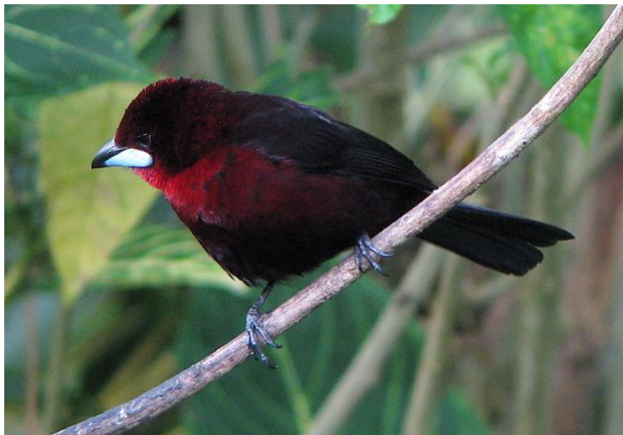
Silver-beaked Tanager © David Ascanio

The Lodge: Constructed in a clearing on the edge of the forest, the lodge complex is the site of most of the human activity in the area. Right around our lodging accommodations and the restaurant we are likely to find a number of species associated with edge-type habitat, which makes for an easy introduction to the birds of the area. Merely stepping outside of our rooms will yield a fine array of birds that includes Southern Lapwing, Guira Cuckoo, Pale-vented Pigeon, Reddish Hermit, Black-throated Mango, White-eyed Parakeet, Fork-tailed Palm-Swift, Streaked Flycatcher, Yellow-rumped Cacique, White-lined and Silver-beaked tanagers, and Grassland Sparrow to name a few.